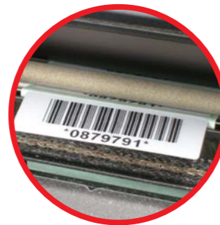
Amazing peel-off model performs on labels just 10mm high