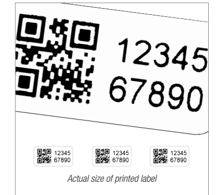
Ultra-high 600 x 1200dpi resolution using a microstep drive control system