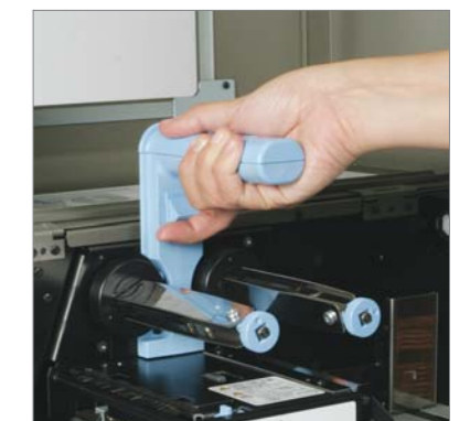
Vertical lifting head unit for easy access