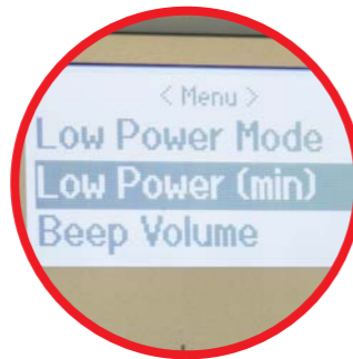
User-friendly and informative large LCD read-out