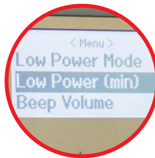
User-friendly and informative large LCD read-out