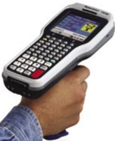
An optional user-installable and removable pistol grip handle is ideal for highly repetitive scanning.